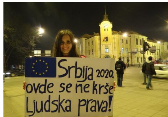
Title: Serbia 2020 , submitted by an entrant to the Justice Competition, World Bank MDTF-JSS, 2014.

More broadly, the Serbian judicial system struggles to fully comply with ECHR requirements, as evidenced by the large caseloads in Strasbourg. Non-compliance tends to be found in a limited number of case types, highlighting specific problems relating to inconsistent application of the law and non-enforcement of the final decisions against state-owned enterprises. It thus appears that the bulk of Serbia's non-compliance relates to financial complaints against public entities, rather than structural problems in the judicial system. Friendly settlements offer some solution here. In an attempt to