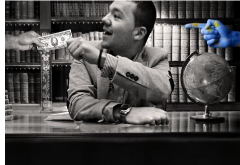
Title: Mito , submitted by an entrant to the Justice Competition, World Bank MDTF-JSS, 2014.