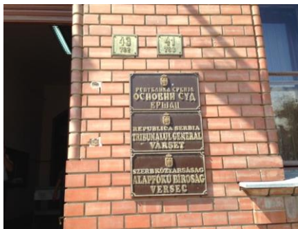
Image of multi-lingual signs at Vrsac Basic Court, 2014.

Equality of access for vulnerable groups poses specific challenges. The majority of citizens surveyed reported that the judiciary is equally accessible regardless of age, socio-economic status, nationality, disability, and language. However, those citizens who are over 60 years of age, live in rural areas or have the least amount of education find the judicial system particularly inaccessible, suggesting that