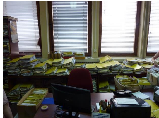
Image of a Registry Department in a Basic Court, 2014.