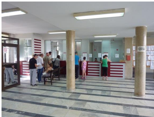
Image of a Queue for Administrative Services at a Basic Court, 2014.

Meanwhile, the efficiency of administrative services 21 is high and improving, but unfortunately many of these functions will soon be taken from courts. The time required to complete verification tasks has reduced by one-third from 2009 to 2013, and in at least half of all cases, verification can be completed at one location within a half-hour. User satisfaction is often over 70% and has increased