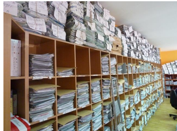
Image of a Registry Office in the Enforcement Department of a Basic Court, 2014.