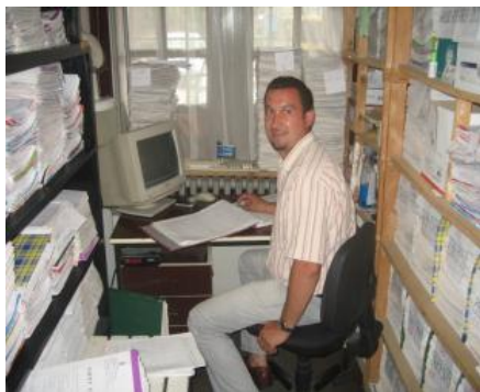
Image of cramped workspace in a Misdemeanor Court, 2013.

The insufficient capacity of existing infrastructure affects service delivery. There is a lack of courtrooms in courts and interview rooms in PPOs. Poor working conditions are identified by many stakeholders as a significant reason for reduced quality of court services. Courts commonly occupy buildings designated as cultural heritage sites, which makes maintenance and renovation difficult and expensive. In addition to maintenance challenges, some buildings were not designed to be courts and do not provide a functional space. In many cases, two or three judges share a single office space and use this 'chambers' as their courtrooms, creating concerns for privacy and security. Despite this, existing courtrooms are not used optimally. Hearings are held only in the mornings and schedules could be tighter to maximize the use of this scarce resource. The lack of space also creates obstacle to reforms that would improve service delivery, such as the establishment of preparatory departments.