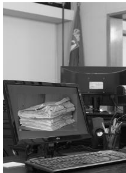
Title: Efikasna Primena Technologije, submitted by an entrant to the Justice Competition, World Bank 2014